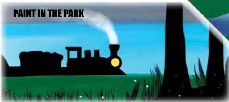
PAINT IN THE PARK